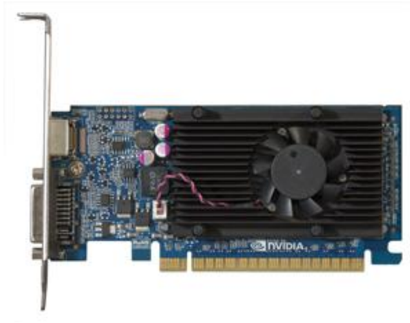
Figure 3: Ports