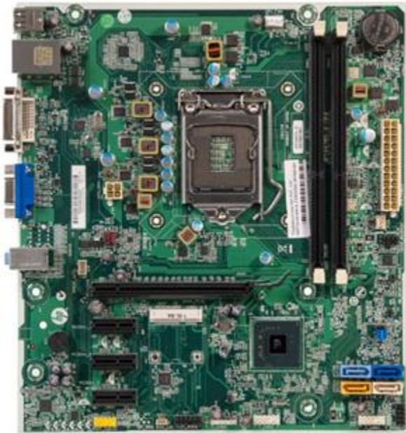
Figure 1: Motherboard top view