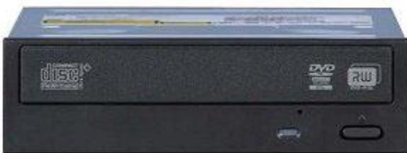
Figure 4: Optical drive