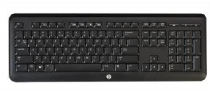
Figure 6: Top view of keyboard

NOTE: Keyboard layout and functionality may vary by country/region.