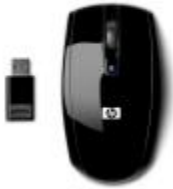
Figure 7: Top view of mouse